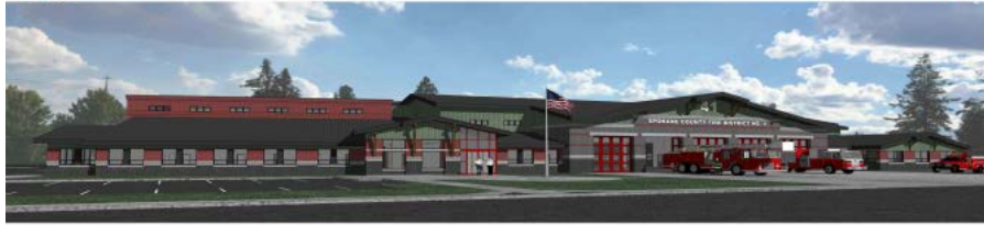
SOUTH FACE RENDERING